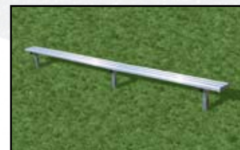
(Above) Permanent Player Bench (Below) Portable Player Bench