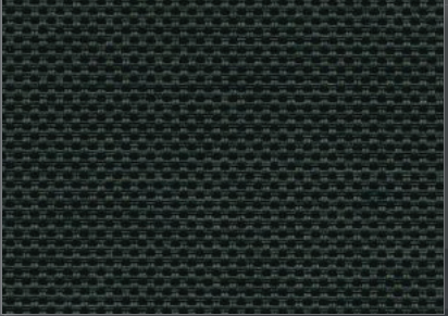
3% V21 Charcoal

The above openness styles are also available in the colors at right.