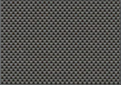
3% V22 Charcoal/Grey