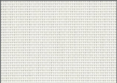
3% P02 White