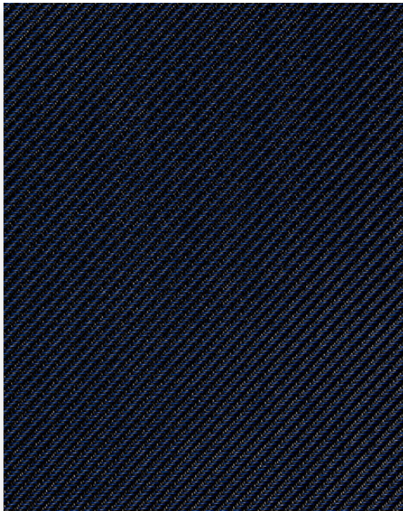
5% 30M394 | Charcoal/Charcoal-Navy