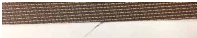
Fiberglass fabric with Fraying