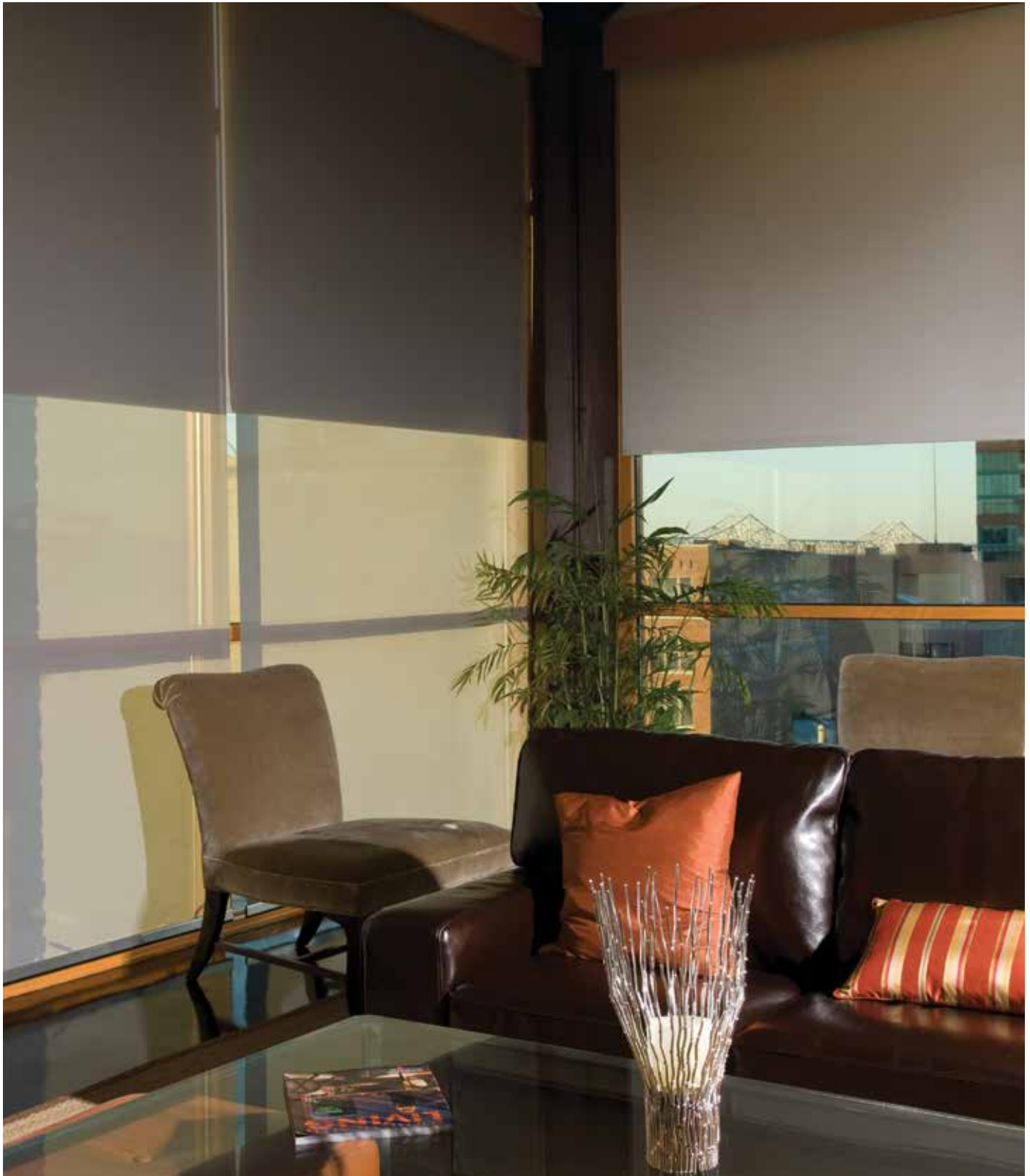
Product: Motorized Shades/Dual Roller Shades. Dealer: Best Blind & Shade, Louisville, KY. Location: Mercantile Gallery Loft Condominiums, Louisville, KY.