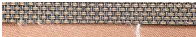
Polyester Fabric with Fraying