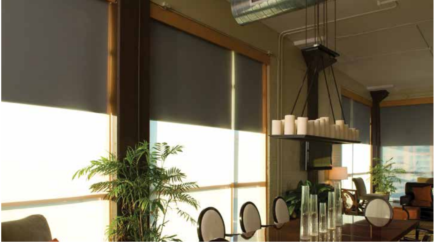
Pages 2—3; Product: Motorized Shades/Dual Roller Shades. Dealer: Best Blind & Shade, Louisville, KY. Location: Mercantile Gallery Loft Condominiums, Louisville, KY.