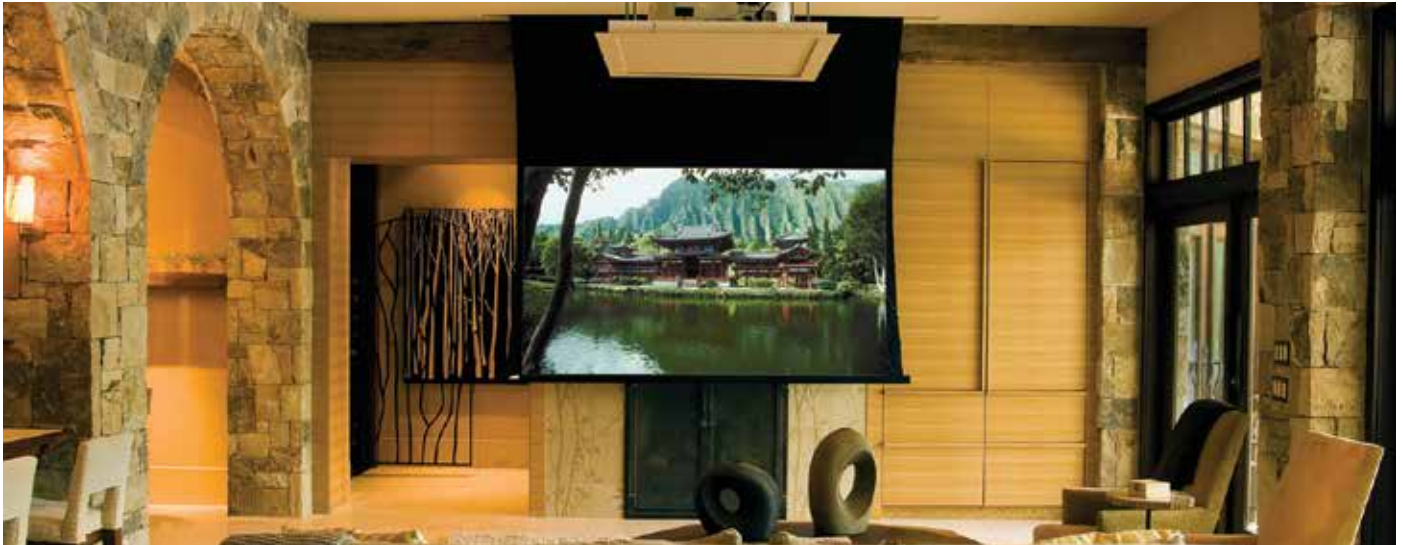
With the right screen surface, ambient light need not “wash out” your viewing enjoyment.