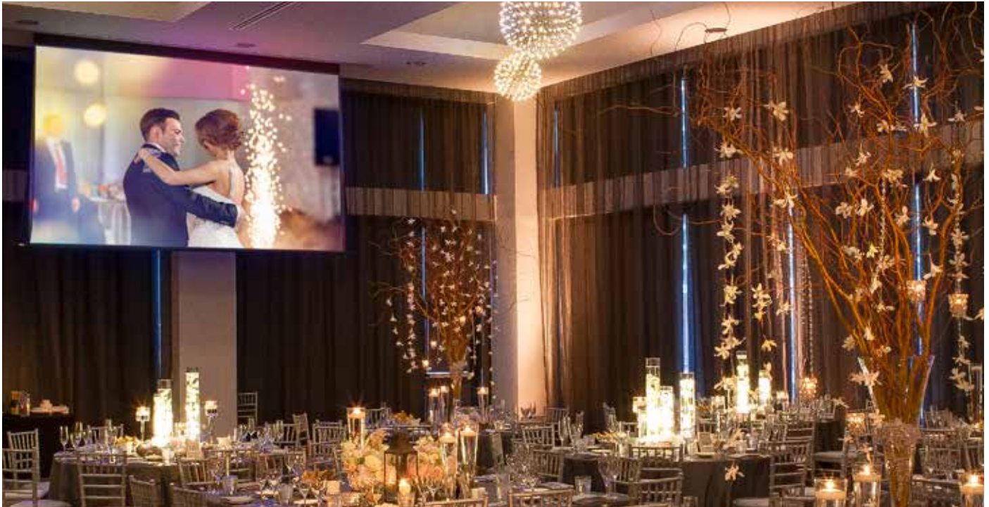
Access XL V., Radisson Blu Aqua Hotel Chicago, IL.