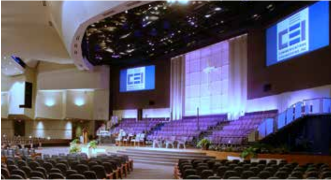
Worship spaces benefit from ALR materials