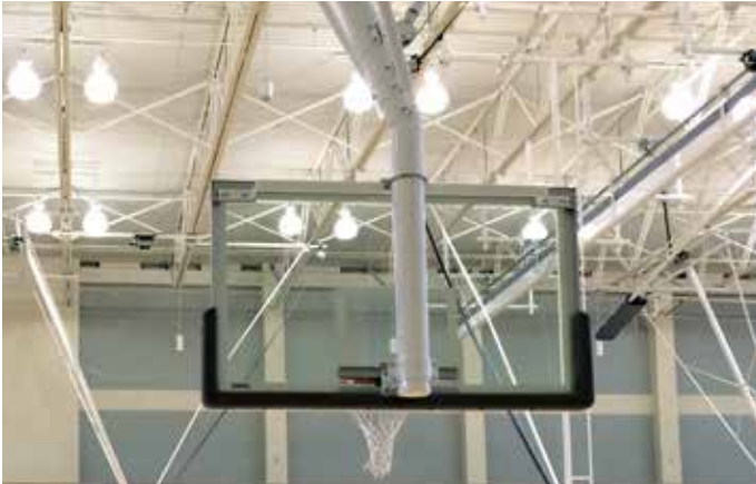
Draper side-folding backstops were modified with a bent stem to fit in the space.

Then we hit on the idea of combining the benefits of two backstop types—the side-folding backstop, and our bent-stem model—to make a product that would fit. Thus was born a custom bent stem side fold backstop which is not part of our normal product offering, but which seemed like the perfect solution.