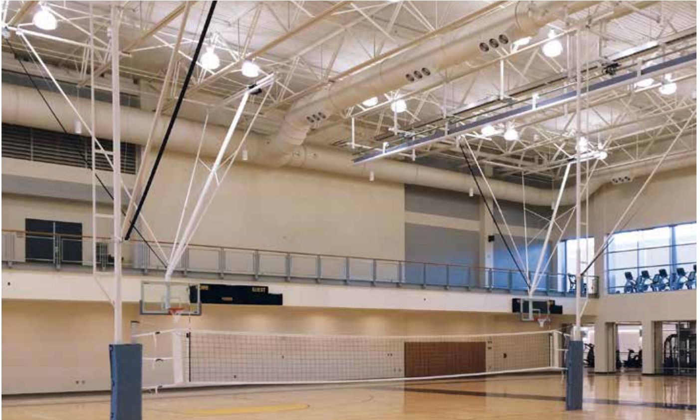
Draper custom backstops and Overhead Volleyball System, part of an installation in the Kennesaw State University Student Recreation Center.