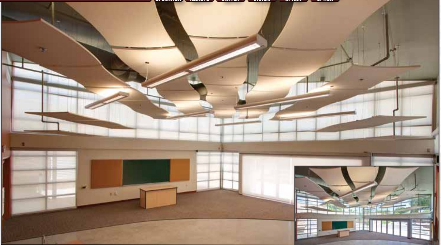
Wherry Elementary School. Architect: Hartman Majewski Design Group. Dealer: Motorized Sun Solutions. All of Albuquerque, NM.