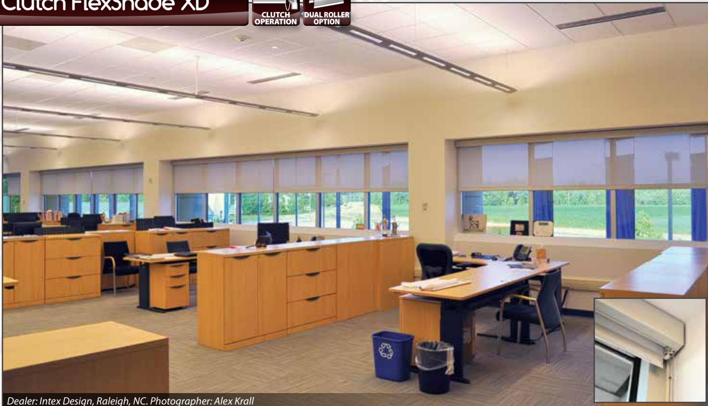
Dealer: Intex Design, Raleigh, NC.