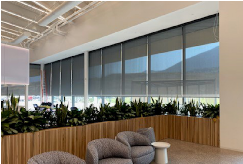
Pluralsight Corporate Headquarters, Draper, Utah. Dealer: Right Touch Installations.

CONFIGURE UP TO 8 AUTOMATED GLARE CONTROL ZONES