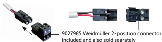
9027985 Weidmüller 2-position connector included and also sold separately

AWG24 – 1 Cable: 2 wire (9.8 in. Weidmüller pigtail non-removable)