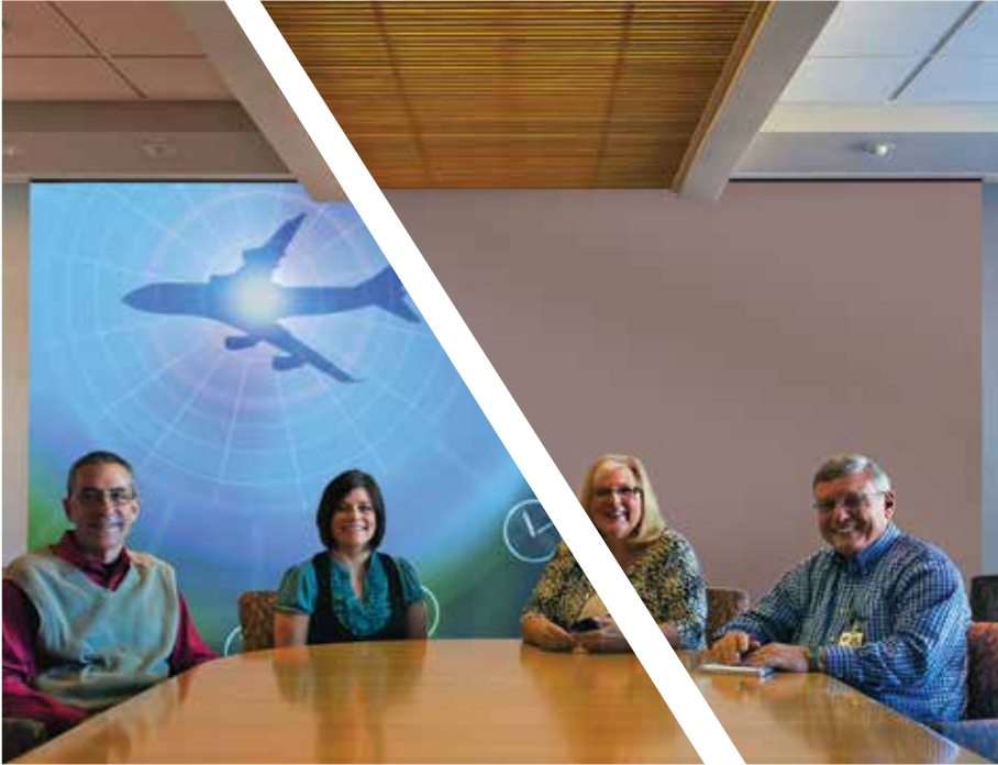
Showing both Screens, digitally printed left, neutral background right.