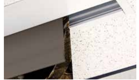
Detail of Dual Screen ceiling-recessed.