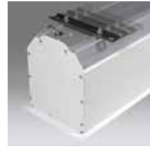
Custom printed VCB Access, Dealer: MCW Solutions, VA, Washington Institute, Washington D.C.

Large venues—such as sporting events, ballrooms, conference centers, or universities—can benefit from the larger video conferencing background sizes available in the electric, ceiling-recessed VCB Access XL E. The bottom closure panel provides access to all components for easier service and maintenance.