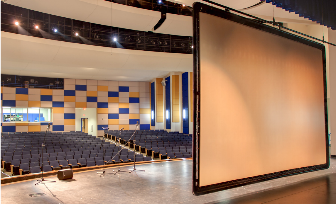
Frisco High School, Frisco, TX.,

DESIGNED TO BE WALL-MOUNTED AND/OR FLOWN