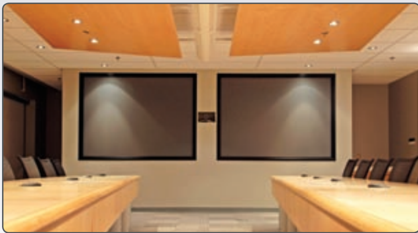
Telus House conference room—Ottawa, Ontario. LEED® Silver Certified.

FROM THE ACKNOWLEDGED LEADER IN THE MOST DEMANDING AREA OF THE INDUSTRY COME 5 UNIQUE REAR SCREENS