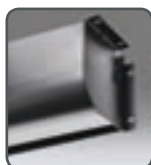
Large style Premier case