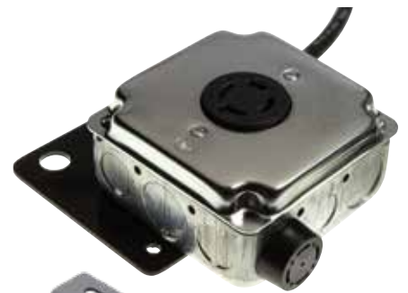
Audible Alarm Kit