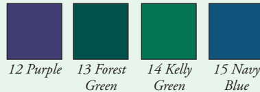
12 Purple 13 Forest Green 14 Kelly Green 15 Navy Blue