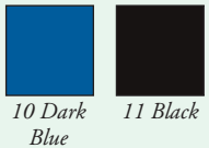
10 Dark Blue 11 Black