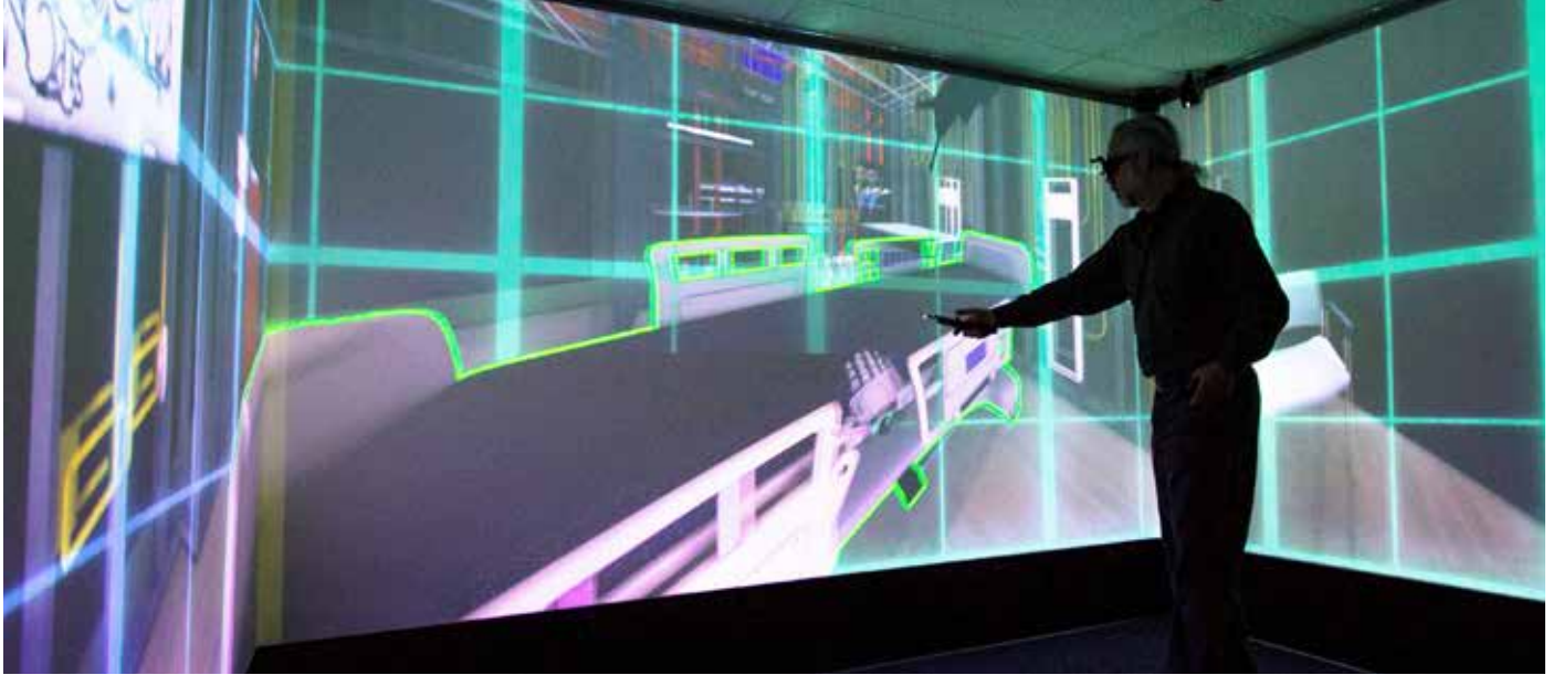
Product: Edgeless Clarion and TecVision XT1000X screen surface.