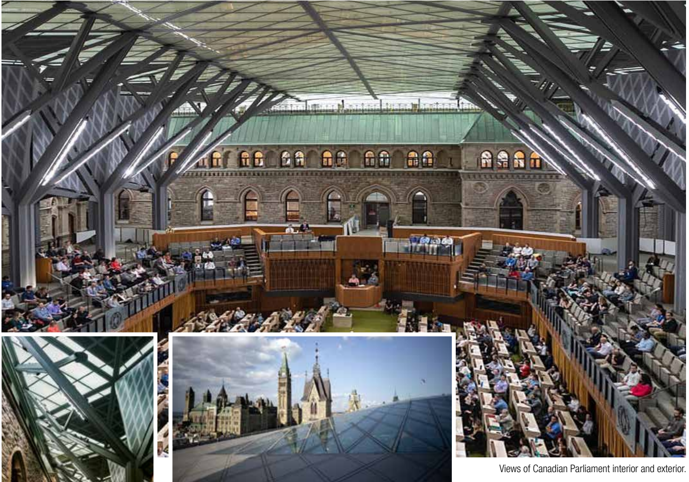
Views of Canadian Parliament interior and exterior.