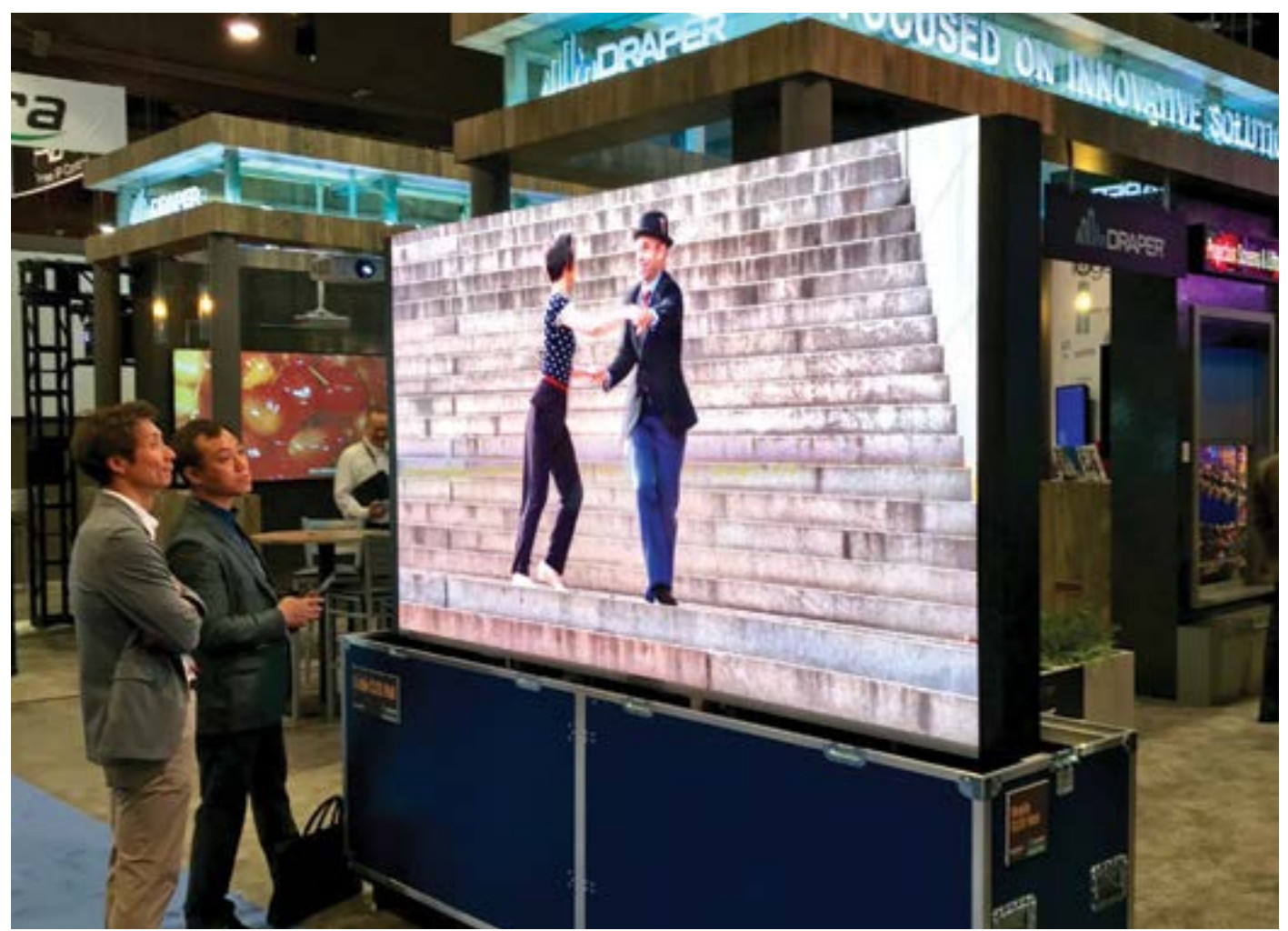
Sony CLED Mobile Solution

Digital signage plays a major and increasingly important role in our society. Video screens are becoming ubiquitous, delivering content ranging from simple wayfinding and advertising to critical emergency alert information.