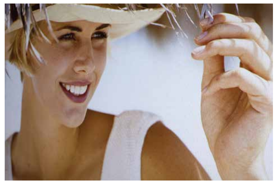
Optically Seamless TecVision XH700X Grey under projection, viewed from 19 inches away. If you can't see anything now, you won't see anything from normal viewing distances on these very large screens!