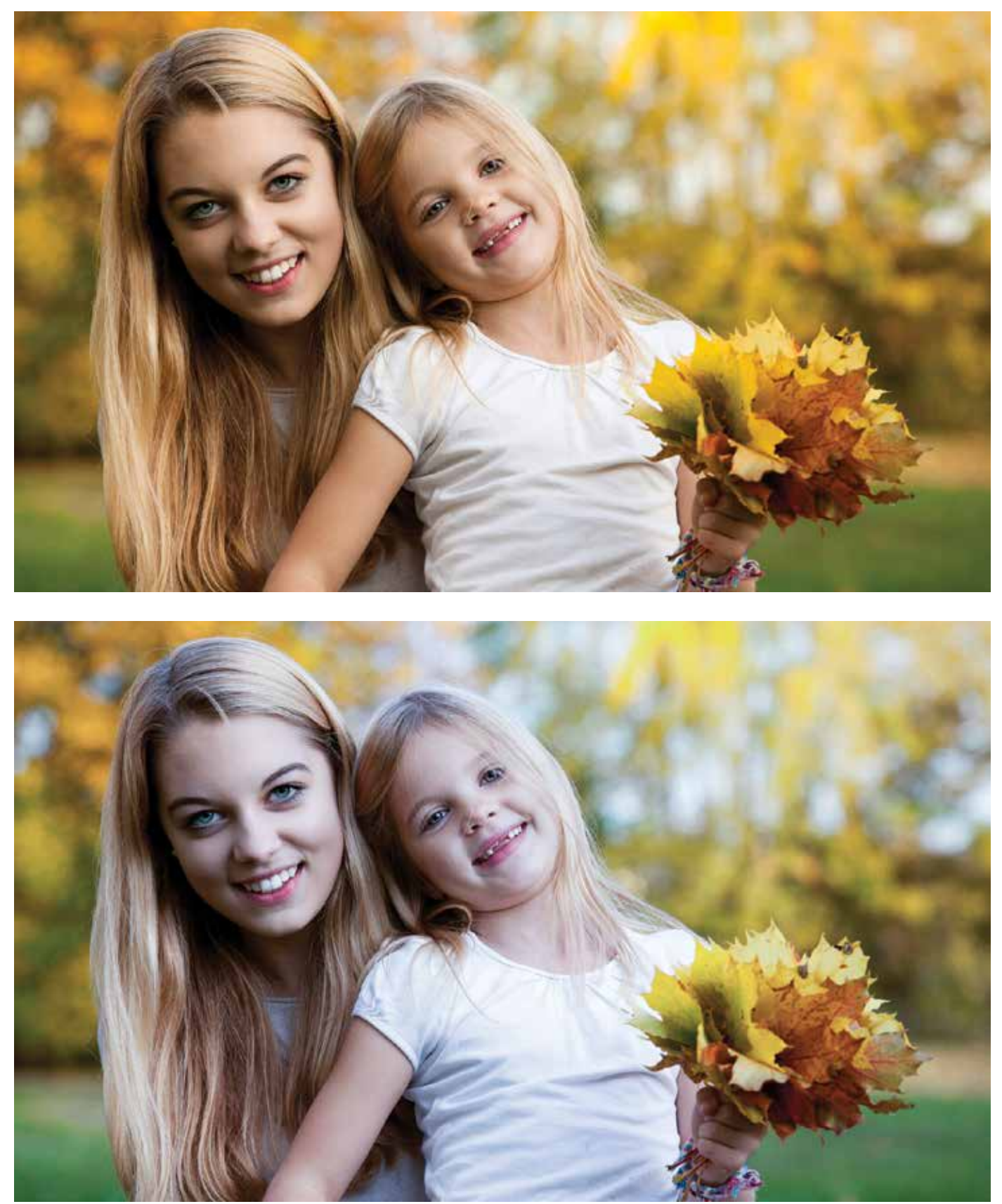
The original image is on the top. The bottom image shows the kind of color shift that may occur when high brightness projectors and screens are not calibrated for accurate image reproduction.