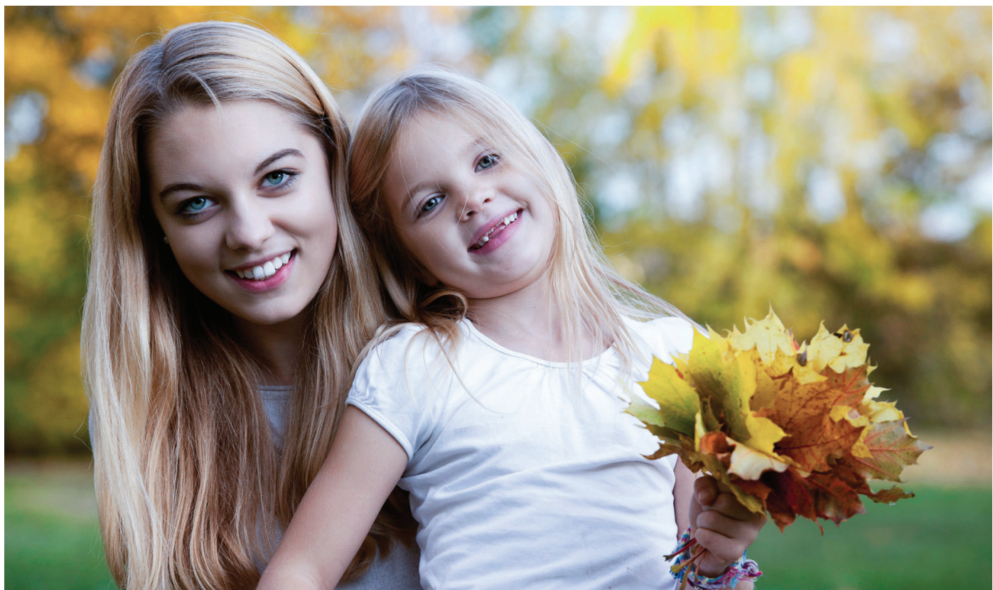
The original image is on the top. The bottom image shows the kind of color shift that may occur when high brightness projectors and screens are not calibrated for accurate image reproduction.