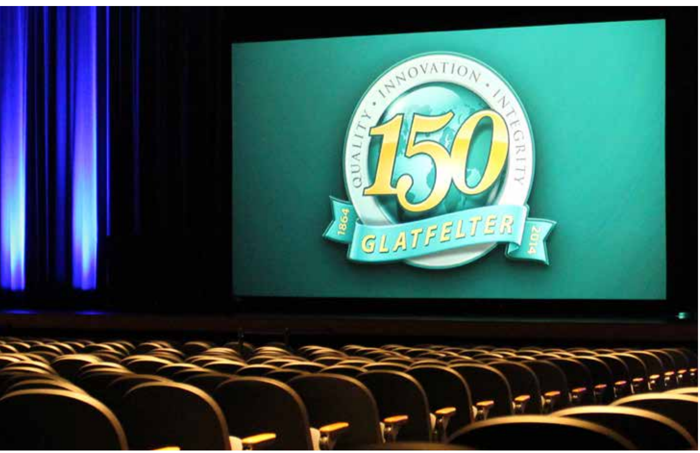
Product: 15' X 26.5' StageScreen, built using various frame pieces Reynolds AV had on hand, adding a new viewing surface.

StageScreen® is a modular truss system concept in projection screen design. It is designed specifically to be flown, but can also be used with legs. Either way, it is the strongest, most rigid and size-adaptable screen on the market.