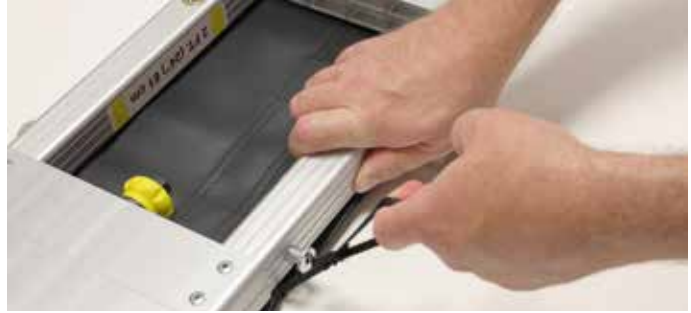
StageScreen® features DuraLoop™ bungee cord loops with nylon pull-tabs; simply hook the surface to the posts on the frame. This system lasts longer than traditional snaps, and provides even, self-centering tension for the viewing surface.