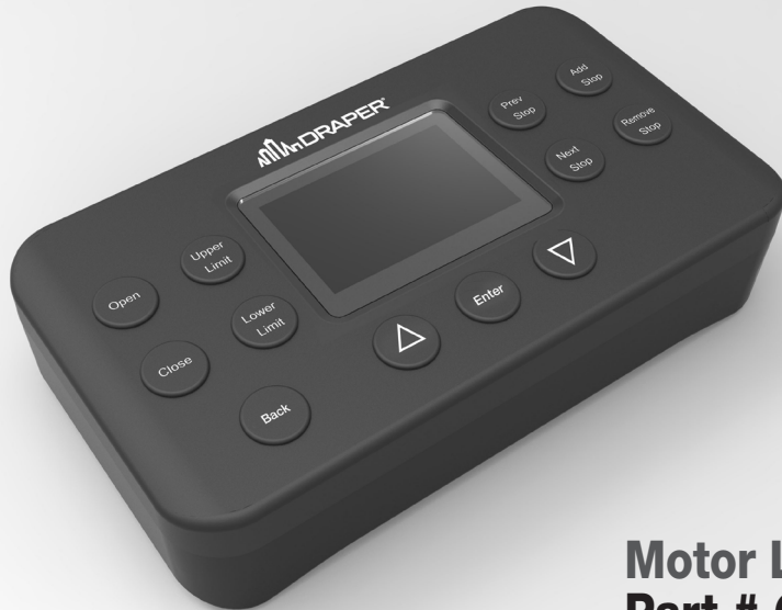
Motor Limit Tool Part # C202.047