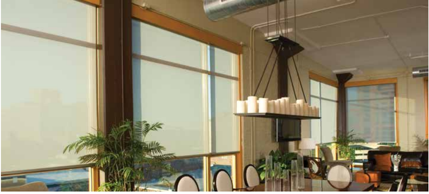
Product: Motorized Shades/Dual Roller Shades. Location: Mercantile Gallery Loft Condominiums, Louisville, KY.