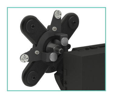
Connection Assembly: Corner