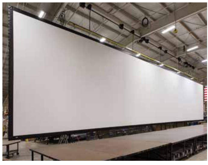
One of two 120 foot wide StageScreens® before being shipped out to Detroit.