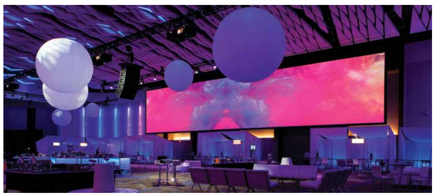
Draper's StageScreen® set and ready for the Charity Preview.

When it comes to the North American International Auto Show put on every year by the Detroit Auto Dealers Association, big and flashy is nothing new. In fact, it's pretty much required.