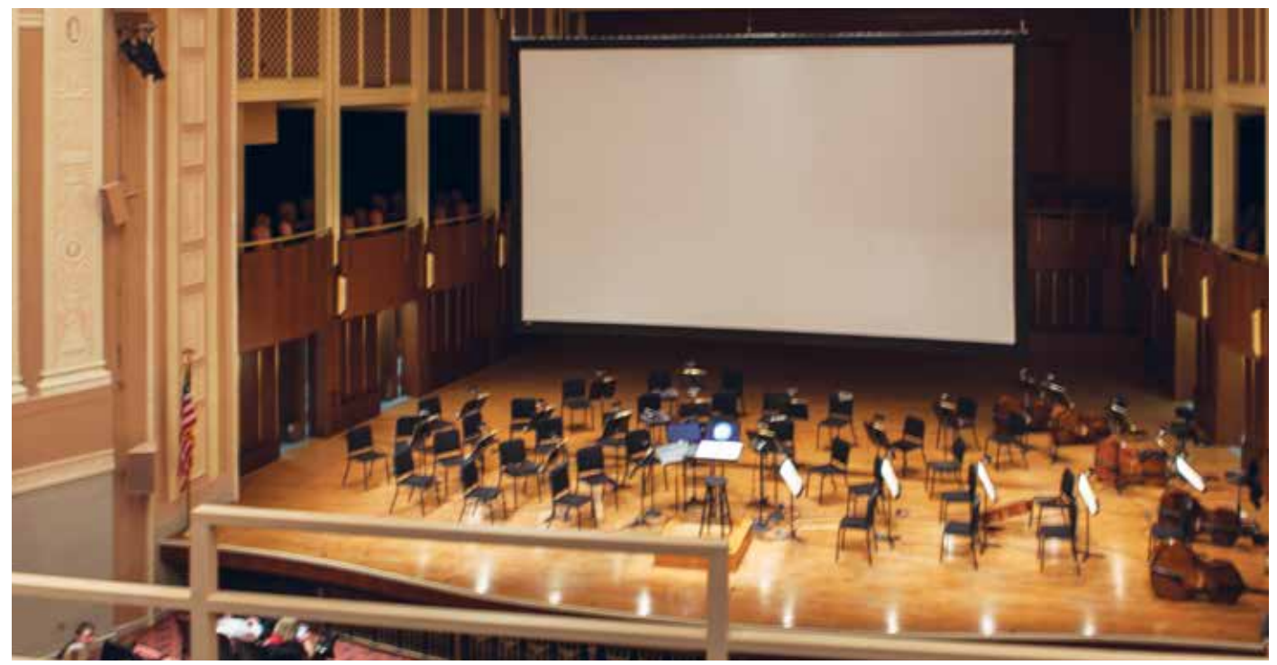
The StageScreen® takes center stage at the Hilbert Circle Theater in downtown Indianapolis for a showing of Alfred Hitchcock's "Psycho," with the soundtrack performed live by the Indianapolis Symphony Orchestra.

StageScreen<sup>®</sup> is often chosen for scale, ease of setup, and versatility, all due to the sturdy interchangeable frame pieces.