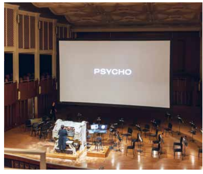
A pipe organ recital warms up the crowd just before the movie.

lumen DLP projectors are used to project the image in HD quality onto the Draper Stagescreen<sup>®</sup>, which I have used pretty much exclusively for the past three years," said McGillen, who uses only black-backed front projection surfaces for these productions. "This eliminates the need to attach black plastic to the back to minimize light bleed from downlights and music stand lights, which is very important to keep the contrast ratio high on the screen."