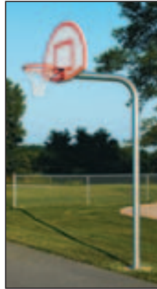
506343—4½" OD Gooseneck Post with 4' Extension, A0133 Fan Aluminum Backboard with Border and Target and A0575 Double Rim Goal with Nylon Net.

* X used to indicate backboard. Y used to indicate goal.