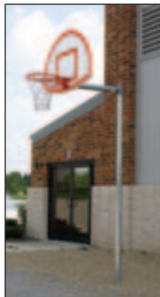
506643—3½" OD Straight Post with 3' Extension, A0133 Fan Aluminum Backboard with Border and Target and A0575 Double Rim Goal with Nylon Net.

* X used to indicate backboard. Y used to indicate goal.