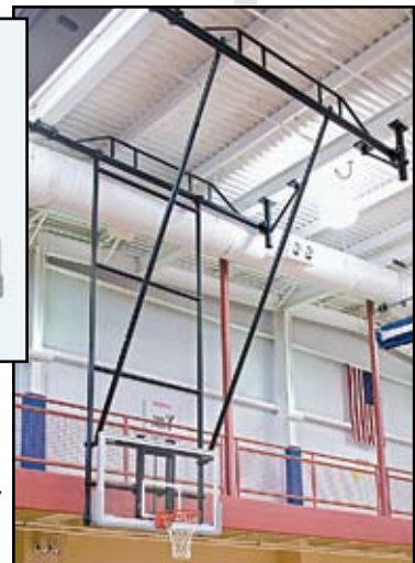
DDTS-21 Ceiling-braced, Stationary Backstop at Owen County Family YMCA, Spencer, IN. Architect: MSKTD & Associates, Inc., Indianapolis, IN.