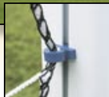
Portable goal net clips