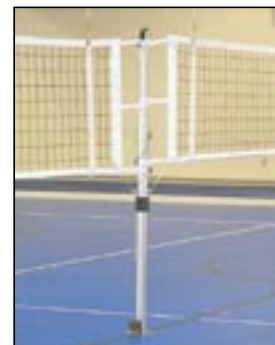
Power Volleyball System Center Standard Kit

Center Standard Kit for multiple court use in conjunction with any DRAPER VOLLEYBALL SYSTEM. Same top quality features with double top sheaves for attaching two nets. Kit includes one center standard (501024 EVS, 501013 PVS, 501021 CVS, 501023 SVS), one winch with folding handle, one net (500004), one pair of net antennae (500007) and one pair of boundary markers (500006). Post pad is optional.