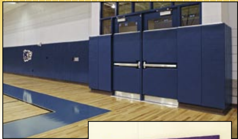
(Above) Oswego (IL) East High School. Architect: Kluber, Skahan + Associates Inc., Batavia, IL.