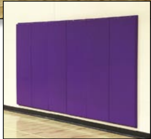
Woodhaven (MI) High School. Architect: The Design Forum, Inc., Grand Rapids, MI.