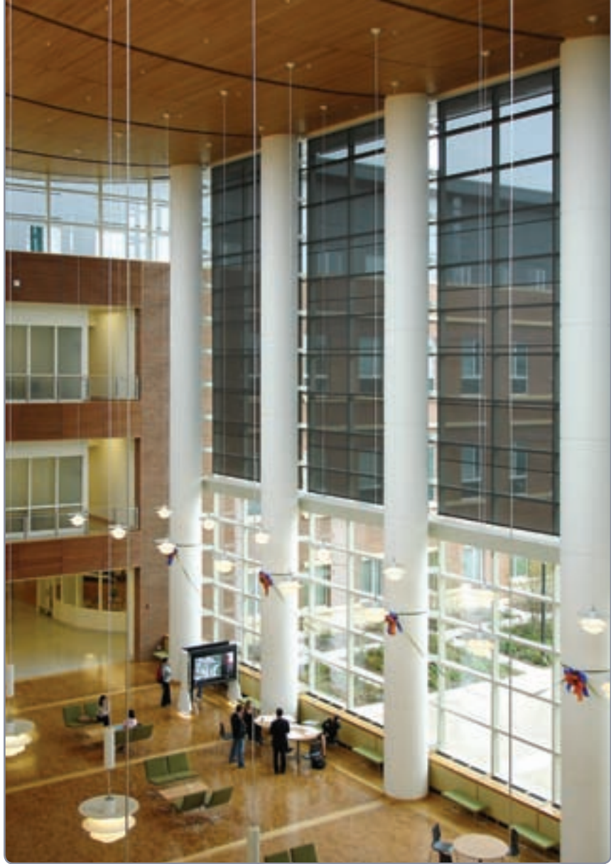
Colossal FlexShades, 20' wide x 40' high and 20' wide x 20' high, with Mermet E-Screen fabric (1% and 5% open), operated by sun sensor. Business Institute of Finance at the University of Illinois. Design Architect: Pelli Clarke Pelli Architects, New Haven, CT. Installation and photography: Real Designs, Champaign, IL.

Bottom of extruded aluminum case is fully enclosed except for slot allowing fabric passage. Bottom closure panel may be removed manually for access to roller and drive unit. Patent pending.