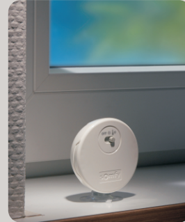
Mounts directly to window sill