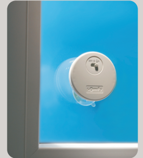
Mounts directly to window glass