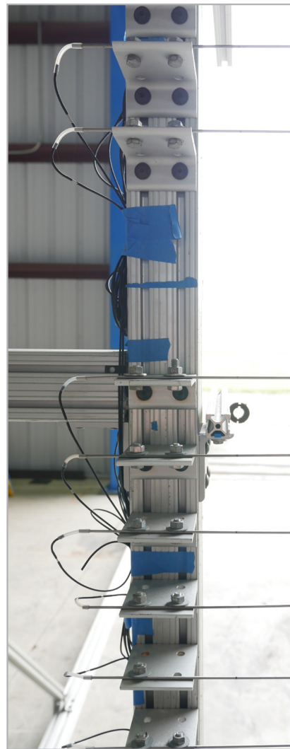
Left: FlexShade® ZIP detail Above: WOW measuring probes.

The test shades were mounted to a metal support structure custom-built of 3" x 3" (7.62 x 7.62 cm) square steel tubing. Two different sizes of frames were provided to accommodate three different shade sizes.