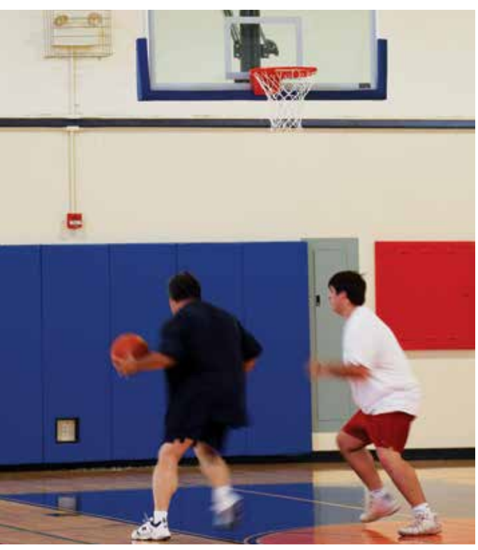
An example of improper padding—there is too much unpadded wall.

being more resilient. Indentation Force Deflection (IFD) is the appropriate measure for wall pad foam quality. IFD is a measure of the force required to compress a four-inch thick piece of foam to a pre-determined percentage of its original thickness. A higher IFD rating equals more shock absorption. Specifiers should not accept any wall pads made with foam that has an IFD of 25% less than 75-80 pounds (34-36 kg).