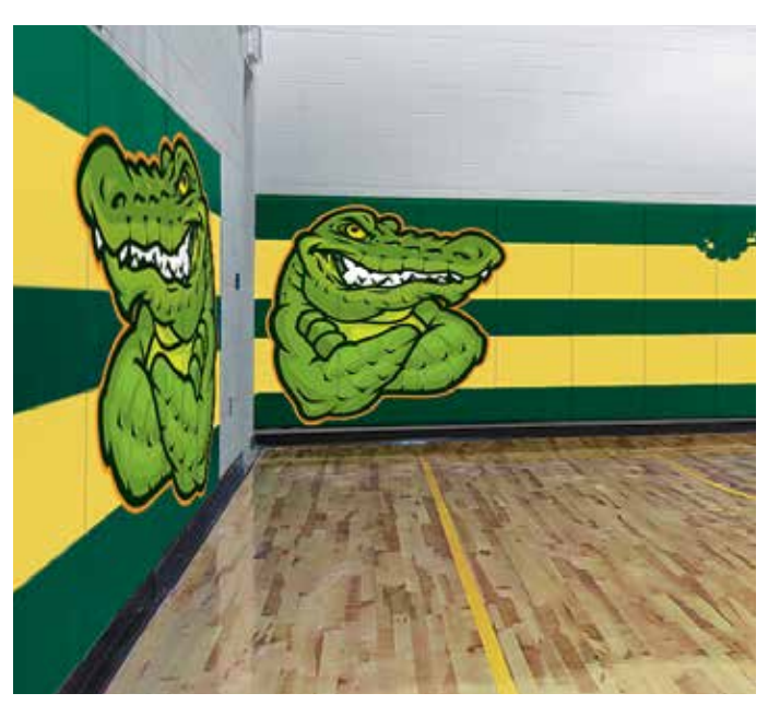
Wall pads, while providing protection with low VOCs, can also serve as a design element with custom printing available.

with ASTM E-84, Standard Method for Surface Burning Characteristics of Building Materials. Class A rated pads meet requirements for maximum flame spread and smoke development and are made with foams that generally will not sustain a flame. Some manufacturers' Class A pads also meet IBC 803.2.1 requirements when tested in accordance with NFPA 286, Methods for Fire Tests for Evaluating Contribution of Wall and Ceiling Interior Finish to Room, Fire Growth. Some jurisdictions only accept this type of pad, so owners and specifiers should check with the local code enforcement body. Class A Rated Wall Pads are definitely required in New York, Rhode Island, Connecticut, and Tennessee. If in doubt, fire retardant wall pads are never a bad idea.