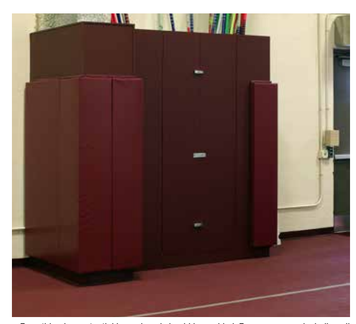
Everything is a potential hazard, and should be padded. Even corners—including all outside corners—and columns should be padded.