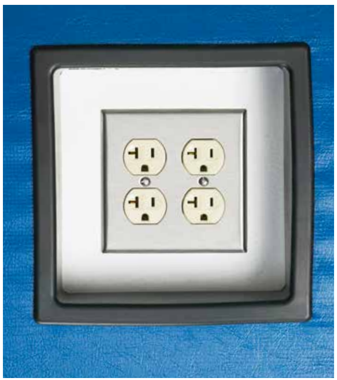
Cutouts can be designed to allow access to power and controls