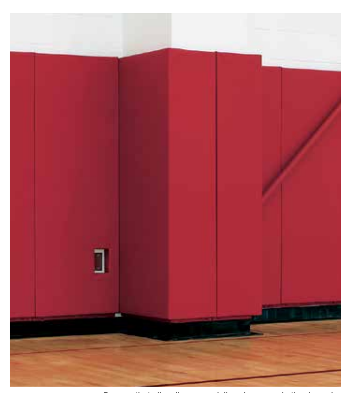
Be sure that all walls—especially columns and other irregular shapes—are wrapped in padding.

With the speed, size, and athleticism of today's competitors, three feet/9 meters definitely is not enough space for an athlete to stop, slow down, or brace for an impact with a rigid surface. At a minimum, all hard surfaces that are within 10 feet/three meters of the playing surface, as well as any outside corners, should be padded. And make sure you don't forget the practice or cross courts because injuries can and do happen in preparation, just like in competition. Wall pads should be mounted on these surfaces in accordance with ASTM standard F-2440-11, which indicates a pad should be mounted no more than four inches above the playing surface.