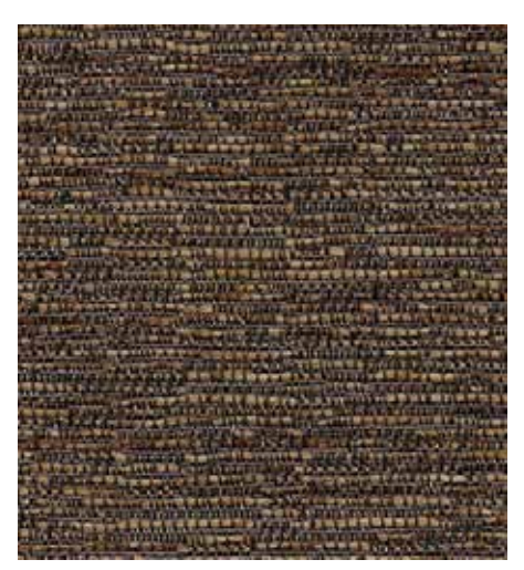
Examples of (from left to right) basket, twill, and jacquard weaves.

Most blackout shades are woven, and the fabric is coated or laminated, but some are made of another material, such as vinyl. A blackout shade is just what the name implies: 0% of solar radiation gets through the fabric. With the use of side and sill channels, a complete blackout with no light leakage can be accomplished. This can be advantageous for privacy, and for maximum reflectance of solar heat, but can also be inconvenient, since the only way to see out or allow daylight in is to raise the shade.