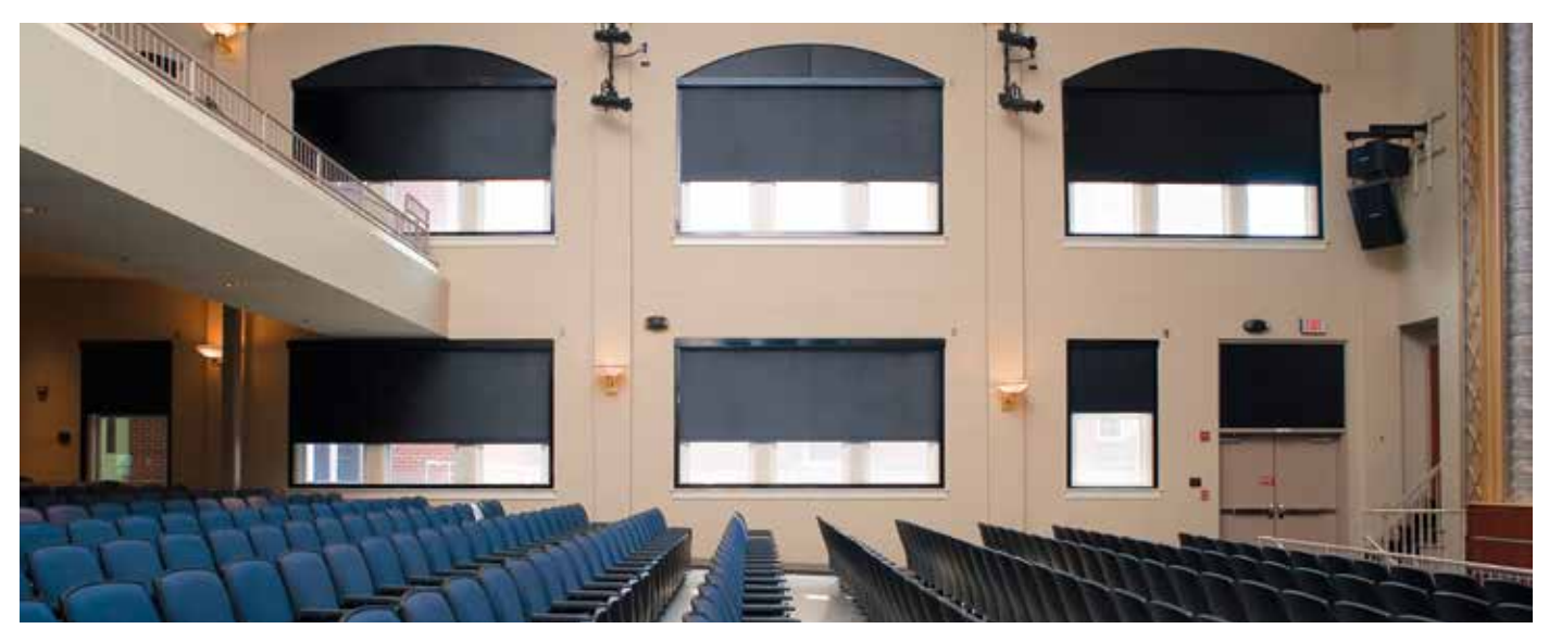
Ursuline Arts Center, Louisville, Kentucky. Motorized LightBloc FlexShades.

of bacteria, mold, and mildew are available. Antimicrobial technology—such as Microban—is infused into the fabric. Certifications to look for include ASTM 2180, ASTM G22, ASTM D 3273, and the Greenguard Mold and Bacteria Standard ASTM 6329.