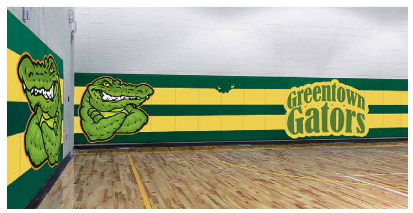
Wall pads not only protect, they can also add to your gym design.