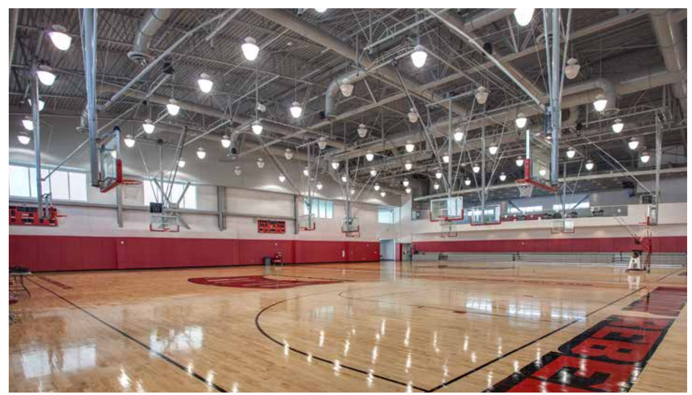
Product: Basketball goals and folding backstops, Mendenhall Center Las Vegas, Nevada.

Build a custom solution that surpasses your expectations in quality, design and innovation when you work with Draper—one of the largest manufacturers of gym equipment in the U.S.