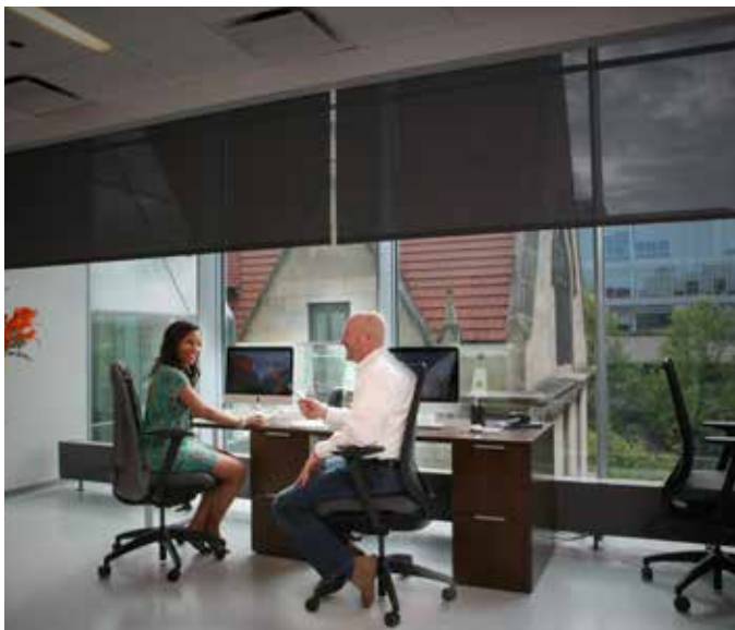
Custom motorized shade systems. University of Chicago Lab School, Chicago, IIL.