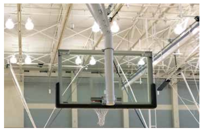
Draper side-folding backstops were modified with a bent stem to fit in the space.