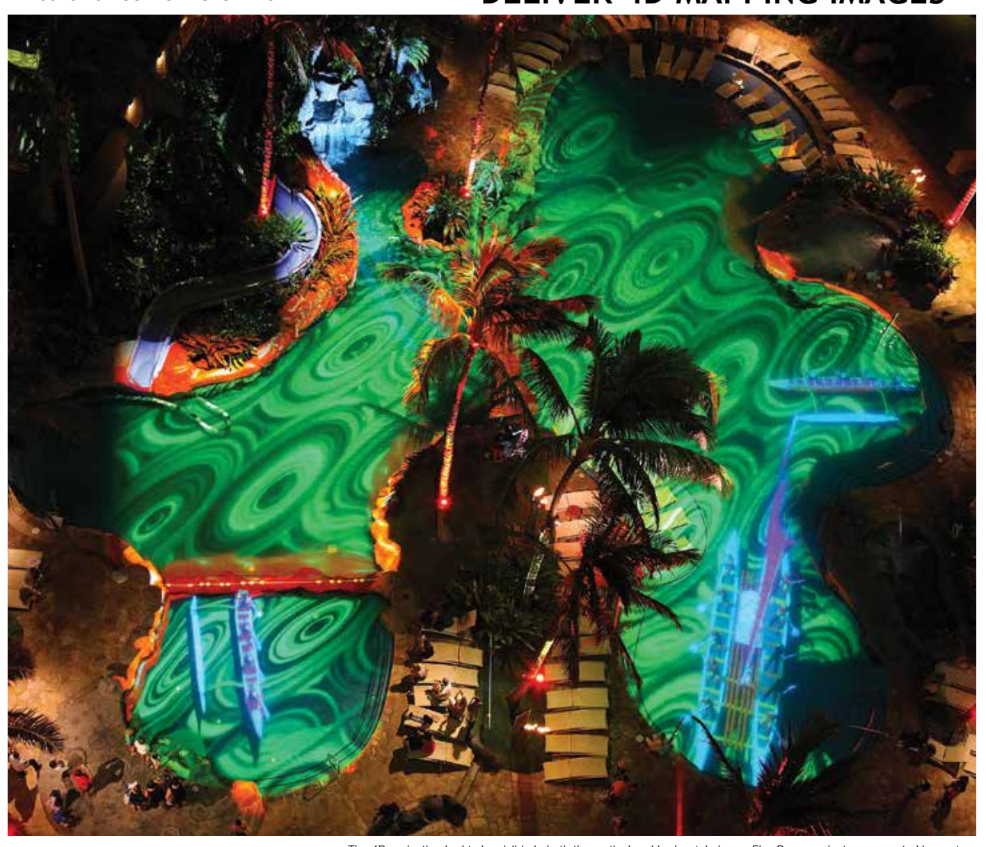
The 4D projection had to be visible in both the vertical and horizontal planes. Five Barco projectors supported by custom Draper projector structures deliver the content onto the pool.

On an unusual job, Draper video projector support structures play a key role in making a 4D reality happen.