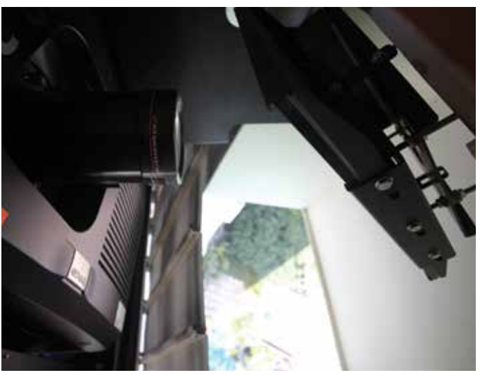
A look at the small mirror from inside the metal rooftop hut.