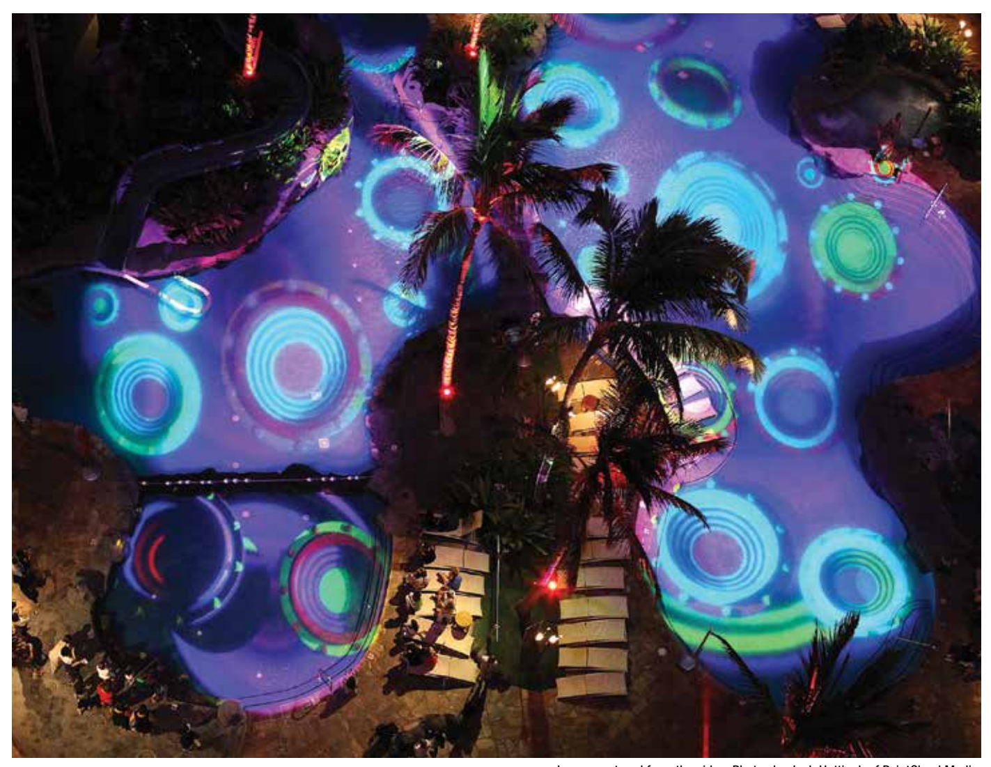
\label{lem:lemmage} \mbox{Image captured from the video.}