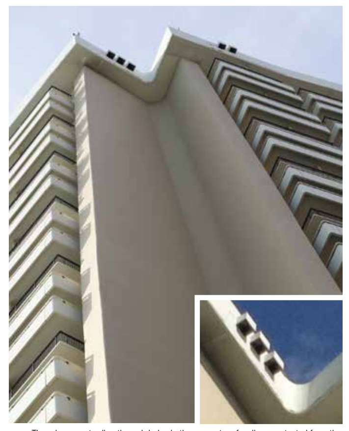
The mirrors protruding through holes in the parapet roof wall are protected from the elements using metal hoods, which also helps keep them as unobtrusive as possible.

Hattingh approached Wagner to work on projectors and support structure needs. To get the desired effect, five Barco HDQ 2k40 and two Barco HDX-W20 projectors were to be used. But, where to deploy them, and how? The pool is part of a large outside area, with no overhanging structures on which to mount and hide projectors. He had to figure out where to put the projectors, and likely have custom mounting structures designed and built—all within 45 days.