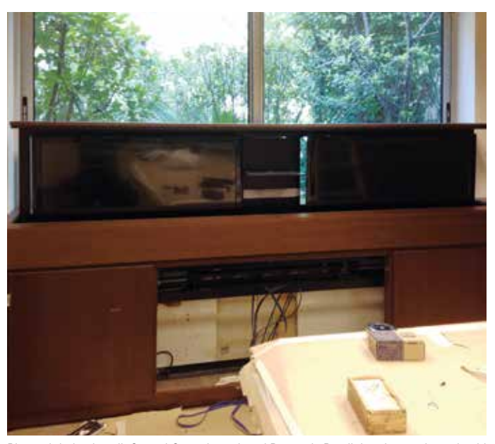
Pictured during install. Control Central convinced Banco do Brasil that the monitors should be out of the way when not in use, allowing the nice view from the windows to be enjoyed when no videoconferencing is taking place.