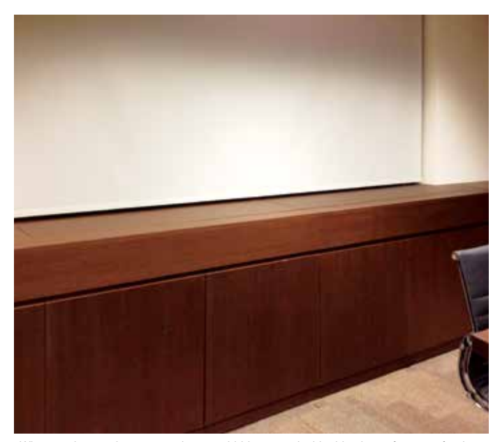
When not in use, the two montiors, are hidden away inside this piece of custom furniture, designed by the project architect to fit around the Draper custom lift. The lift utilizes an extremely quiet motor.

Control Central's proposal called for a significant technology upgrade, including HD projection and a big projection screen, as well as a new videoconferencing system. It also offered a different vision for the two TV monitors. Herrera proposed hiding the monitors when not in use, and lifting them out of a cabinet for videoconferencing.