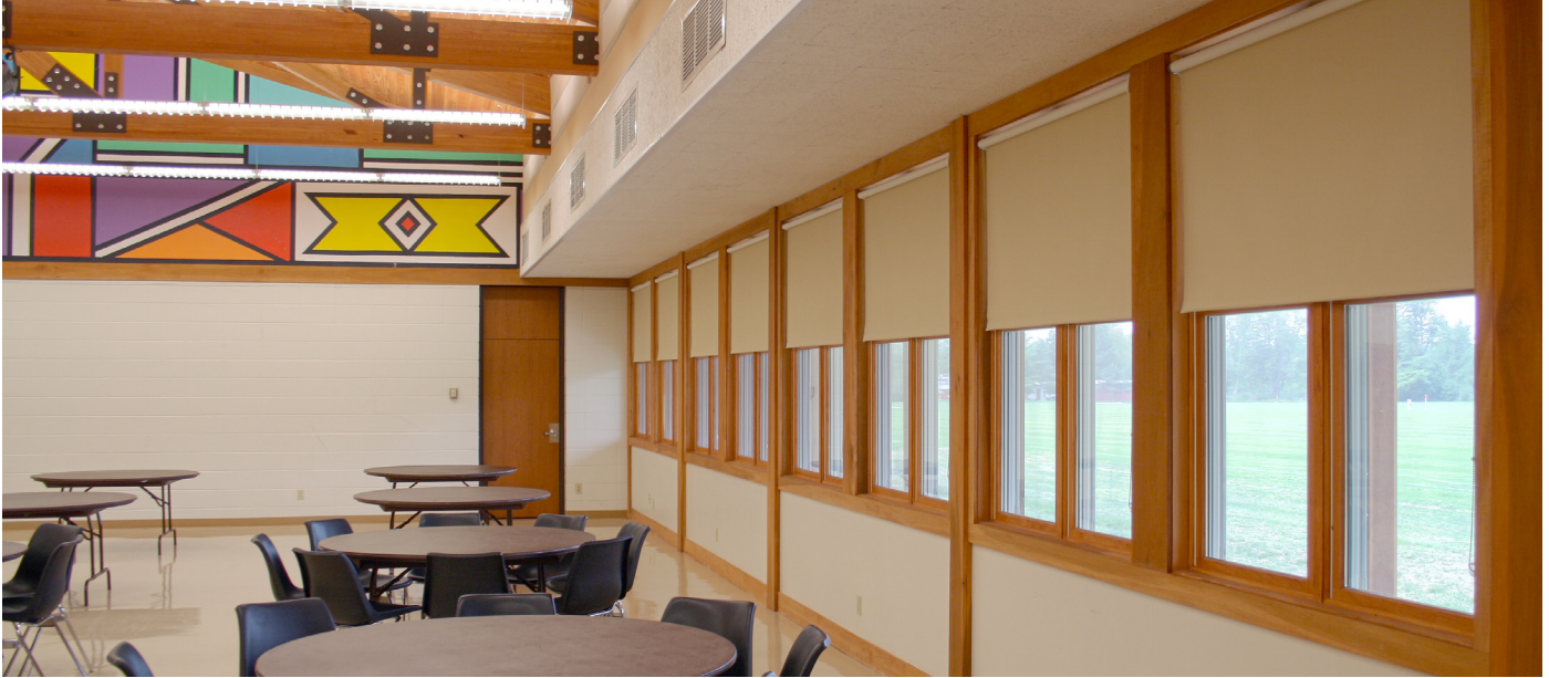
Techmatic Roller Shades, Earlham College, Richmond, IN

AFFORDABLE OPTION FOR SMALLER WINDOW APPLICATIONS