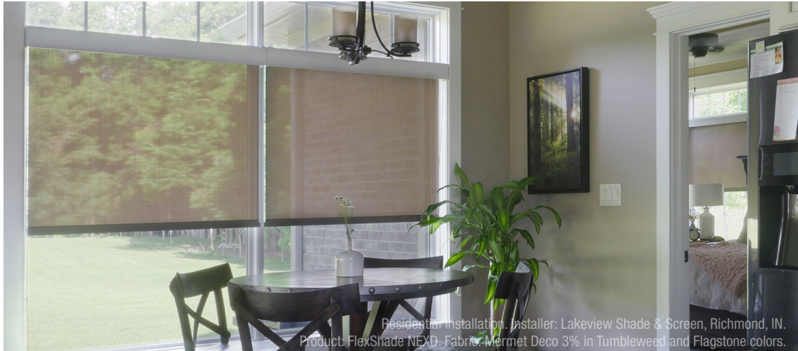
Residential installation. Installer: Lakeview Shade & Screen, Richmond, IN. Product: FlexShade NEXD. Fabric: Mermet Deco 3% in Tumbleweed and Flagstone colors.